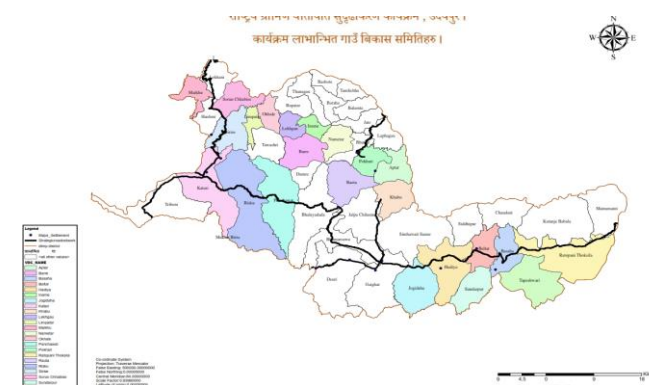
Program Beneficiary VDCs Among District VDCs.