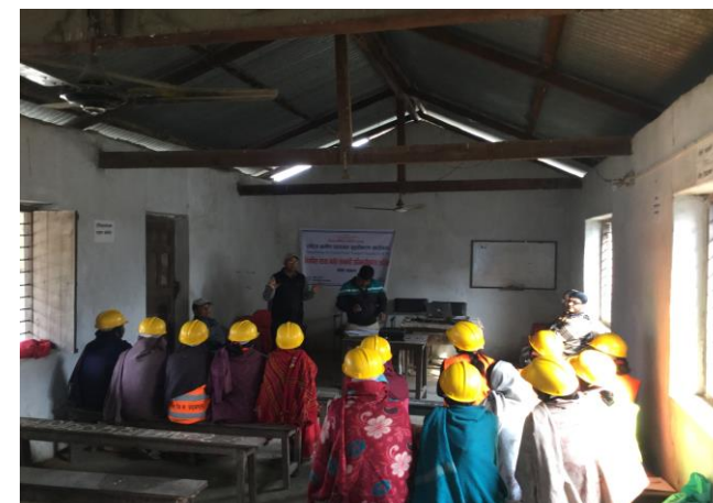
Orientation Training to RMGs and LRUCs